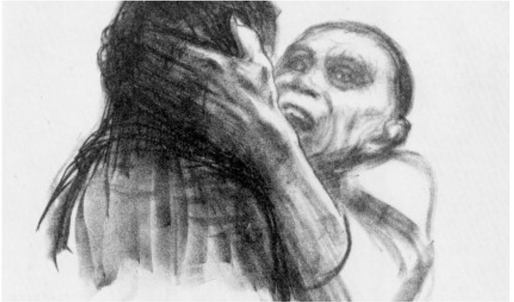
Tod wird als freund erkannt, Käthe Kollwitz